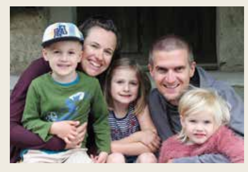
Above: the Hammerle family

Please pray that those kids who heard God's word taught over the summer camp will take that word in and that their hearts will be good soil. Especially those who will have no ongoing contact with the church until the next camp, we ask for prayer that God's word will keep growing in their hearts and that the devil will not take it away.